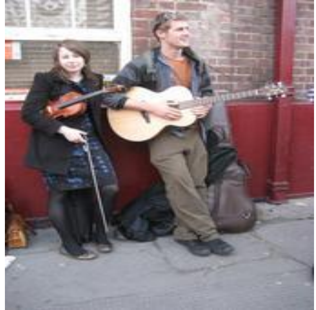
Coco and the Crip